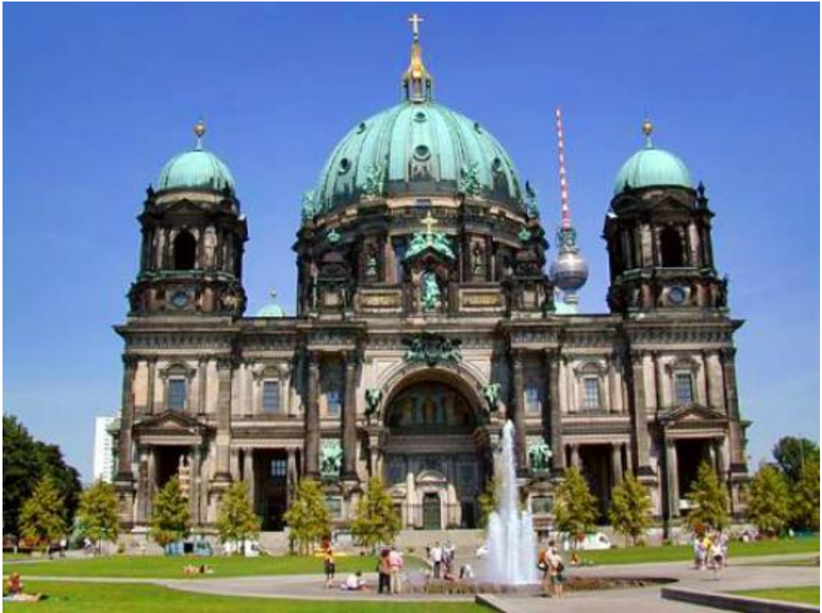
Berlin – Dom Cathedral, 1538 Current Baroque style was completed in 1750.