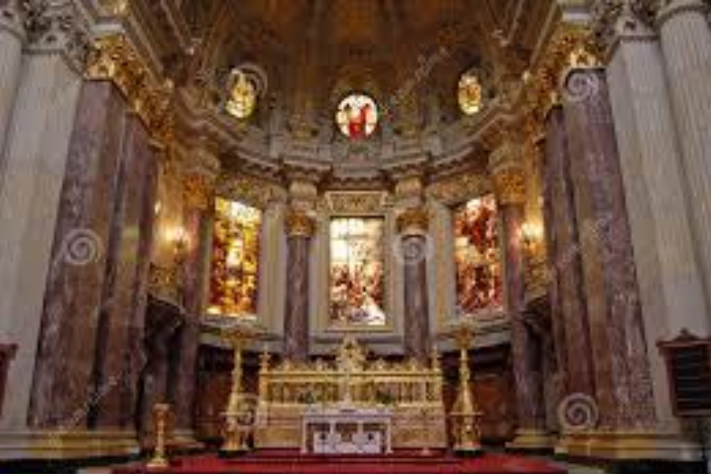
Dom Cathedral - Altar