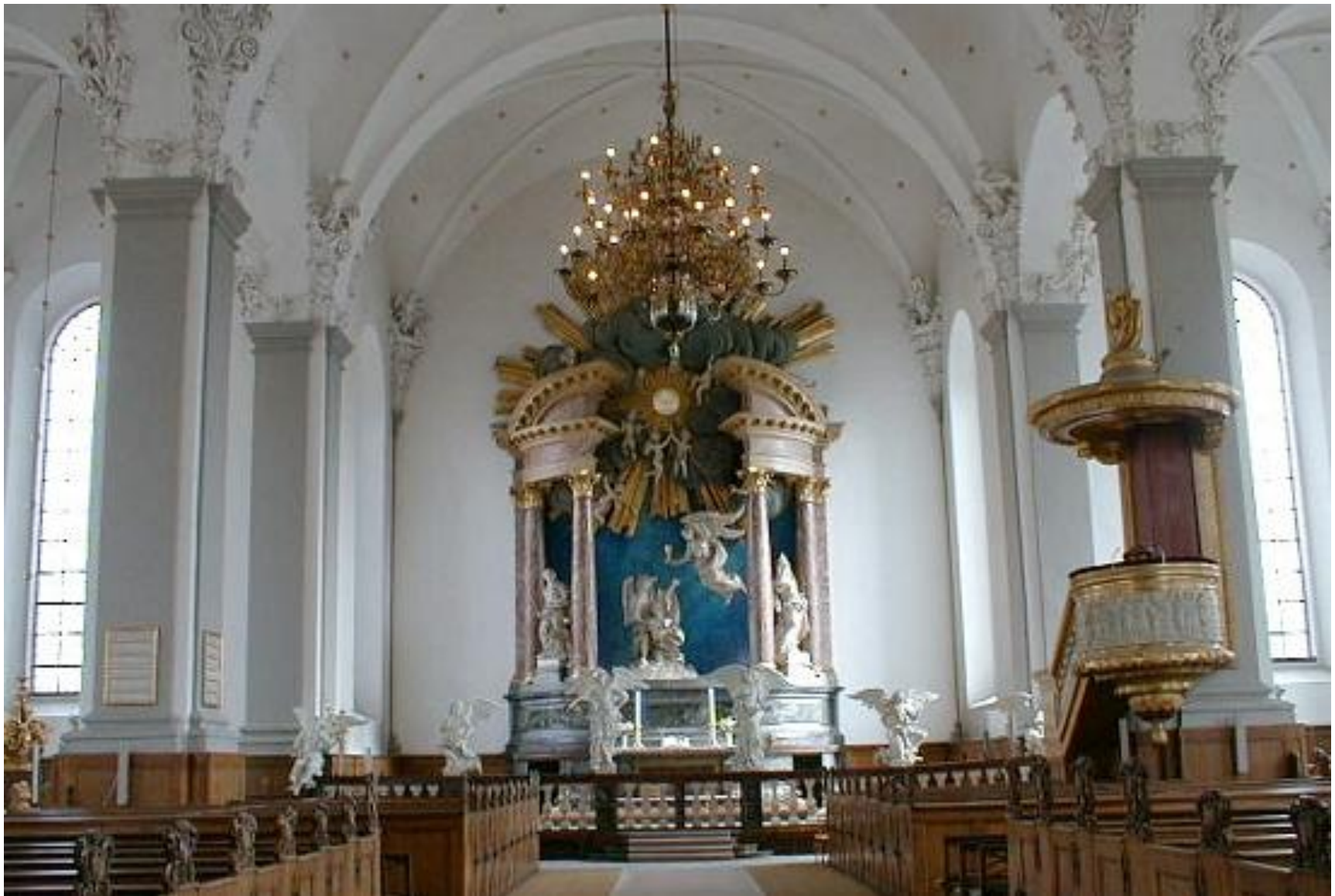
Altar of Our Savior Lutheran Church, Copenhagen, Denmark Construction began in 1682 and completed in 1752.