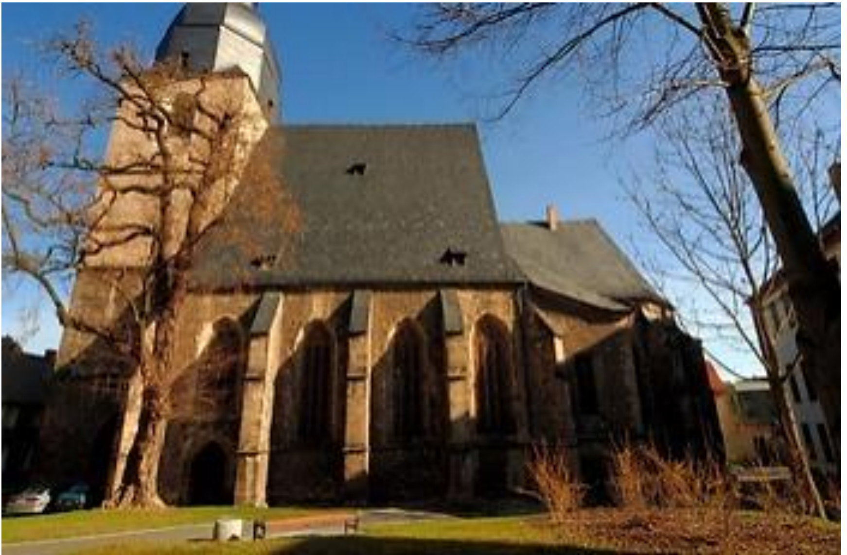
St. Peter and Paul Church, Eisleben, Germany Luther's Home Town Outside view