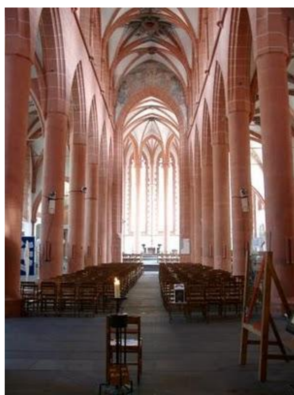
Church in Heidelberg, Germany

The chancel was completed in 1410, the nave in 1441, and the steeple in 1508.