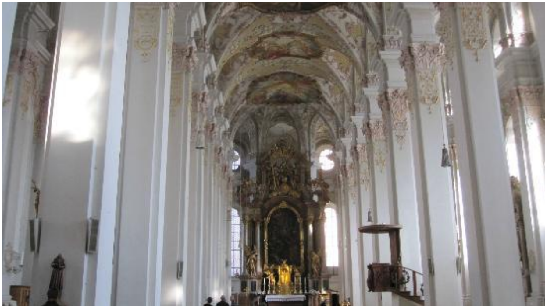
Nave and altar of the Church in Heidelberg, Germany Luther presented his Disputation to Augustinian monks in Heidelberg in 1518.