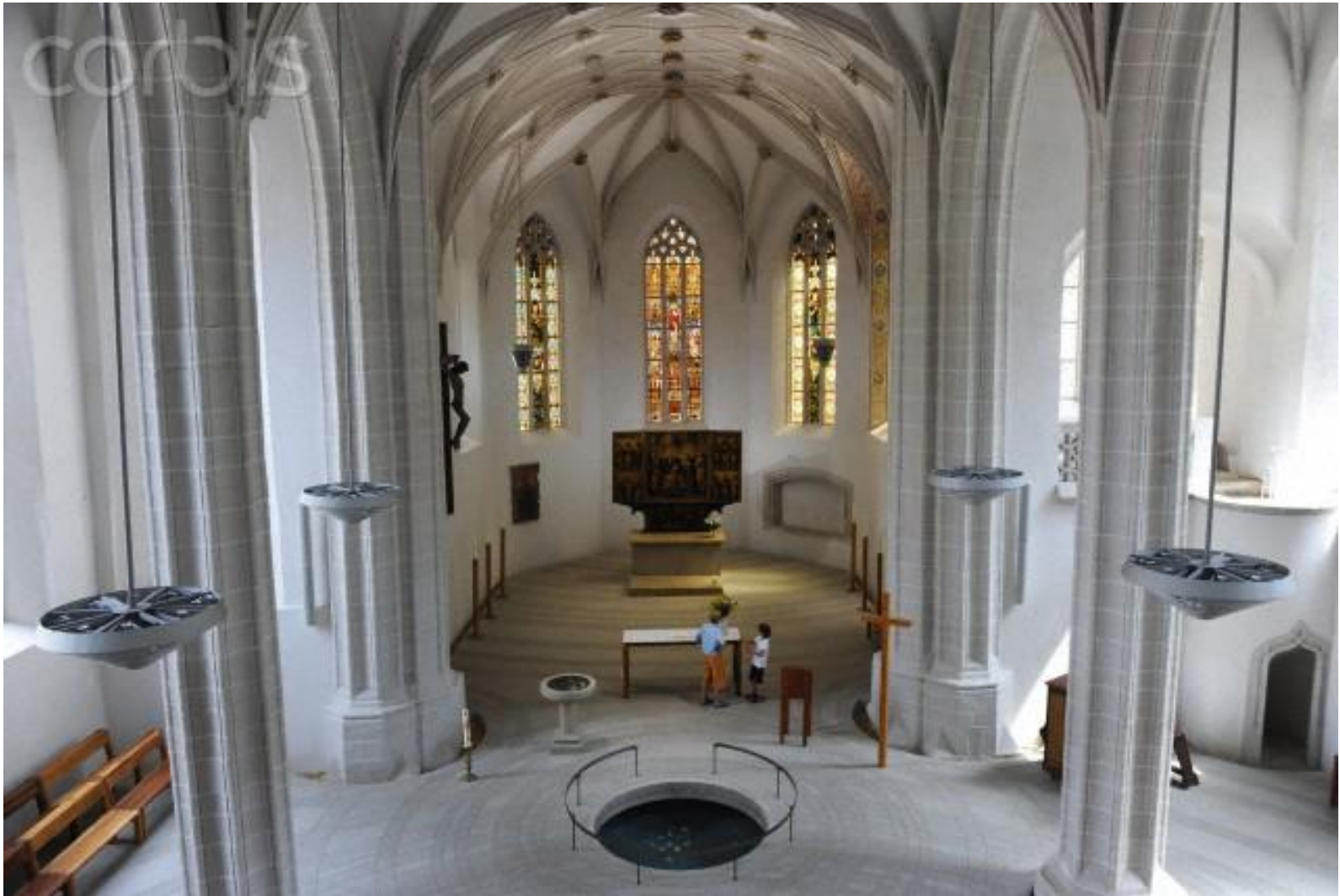
St. Peter and Paul Church, Eisleben, Germany. This is the church where Martin Luther was baptized.