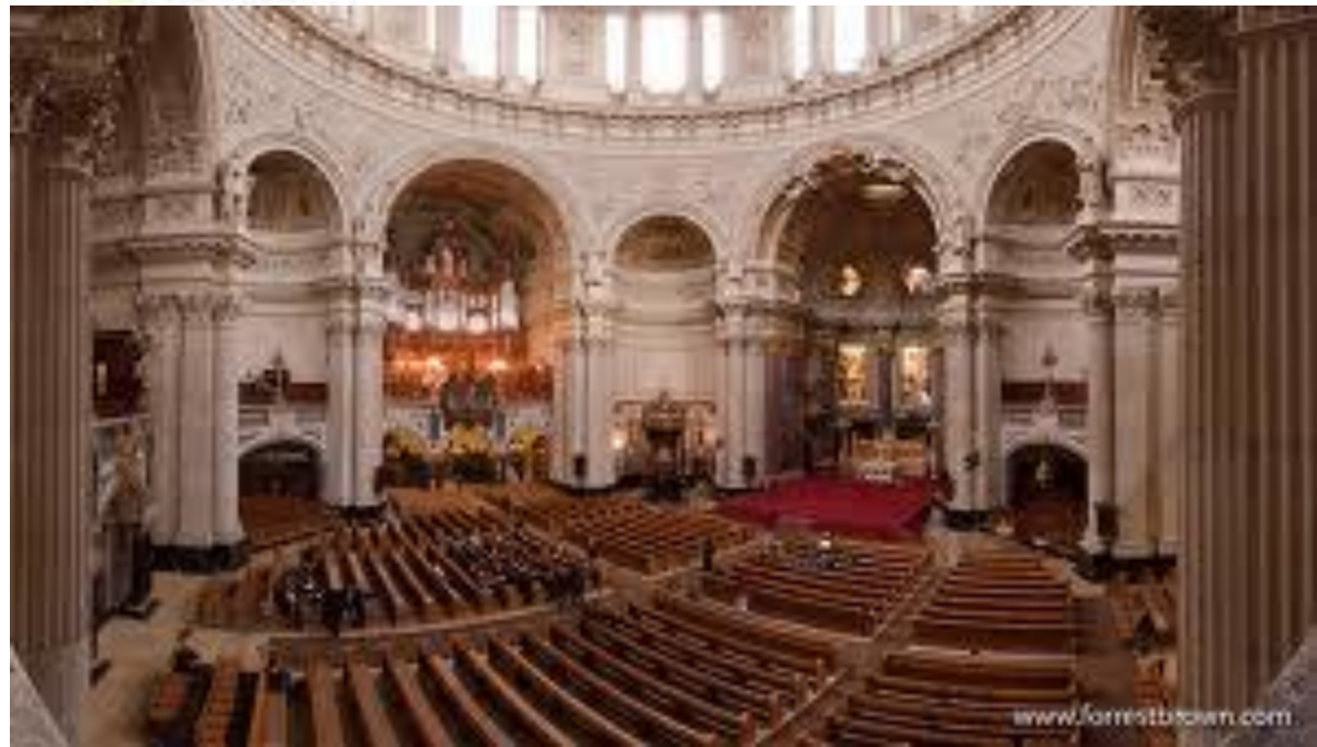
Dom Cathedral - Nave