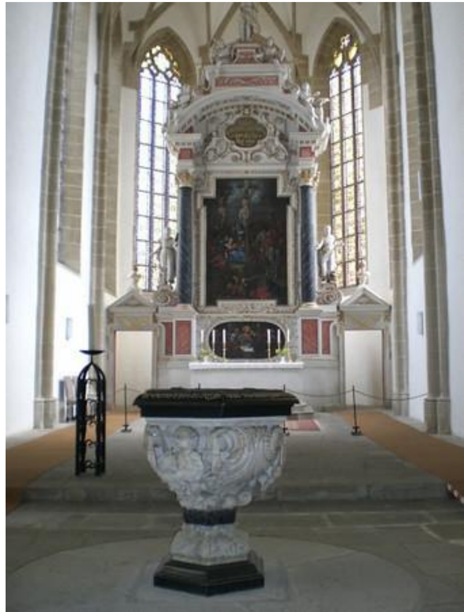
St. Mary's Church, Torgau, Germany Place where Katharine Von Bora ( Martin Luther's wife) is buried.